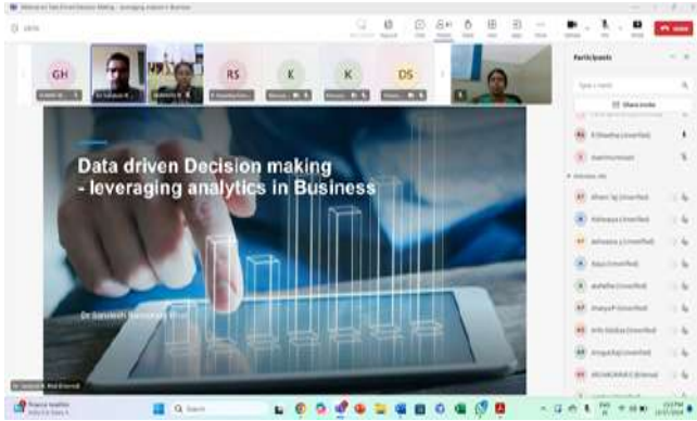
.....Leveraging Analytics in Business