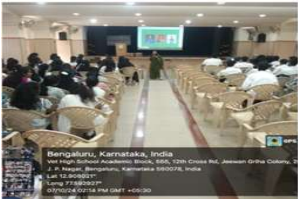
.....Personality development program

VET First Grade College, in collaboration with Right Side and P&G, conducted an insightful workshop on 7th October 2024 for all in the auditorium. The primary objective of the workshop was to promote student growth and development through grooming, personality development, and empowerment, thus enabling students to seize opportunities for personal and professional growth. The workshop emphasized the importance of developing grooming habits and how these habits positively impact both personal and professional spheres. The focus areas were holistic development of students, focusing on self-awareness, confidence building, dressing for success among many. The workshop provided valuable insights into self-improvement strategies, empowering students to take charge of their growth journey.