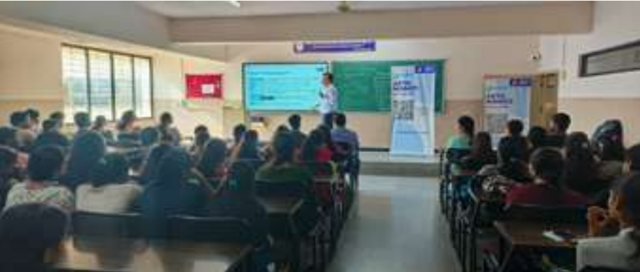
.....Inculcating Entrepreneurship Acumen

On September 18, 2024, VET First Grade College, in collaboration with Arth Nirmiti, hosted a valuable workshop on Financial Literacy for Start-ups, specifically designed for first-year BBA students. The event aimed to ignite the entrepreneurial spirit among young students. The workshop covered essential topics, including Entrepreneurship fundamentals, Financial planning and management, Roadmap to establishing successful start-ups and Practical insights into navigating the entrepreneurial landscape. The workshop benefited 25 students, providing them with essential knowledge and skills to pursue entrepreneurial ventures. By organizing this workshop early in the students' academic journey, VET First Grade College demonstrated its commitment to fostering innovation and entrepreneurship among young minds. This initiative is likely to have a lasting impact on the students' career choices and entrepreneurial aspirations.