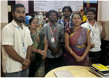
Winners in Inter Department BGMI - Gaming Organised by Techno Club

Short-term courses are designed to equip individuals with specialized skills, enhancing their employability and career prospects. These courses are typically short, focused, and industry-relevant, allowing students to gain practical knowledge quickly. The following short-term courses were offered to BBA students to improve their skills and make them industry ready.