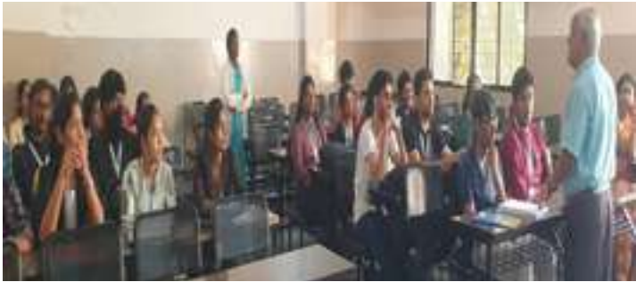
.....Journey towards pronunciation journey