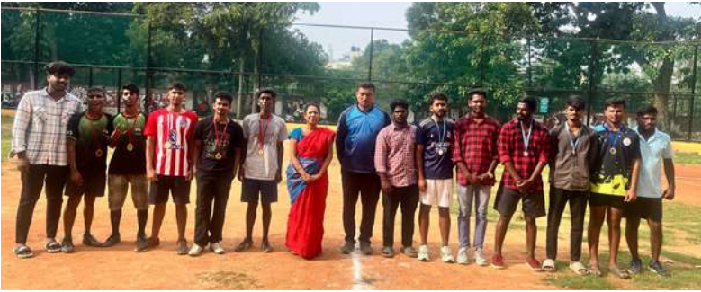
Football Winners in Inter Department Football Tournament organised by Kreedha Spardhe Club